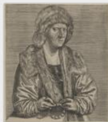
Bildnis des Jakob Fugger