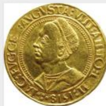
Jakob Fugger unbekannt; Medailleur