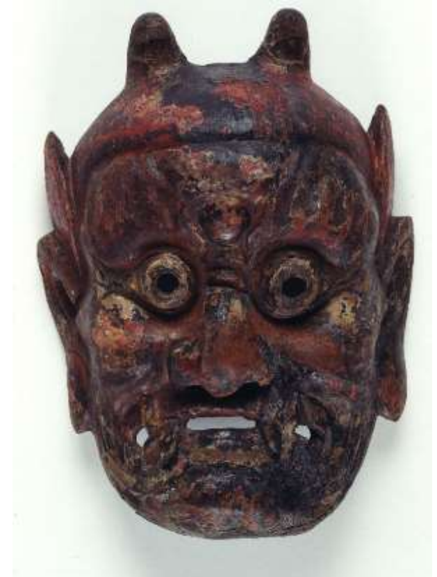
3 masks (Nuo theatre), 19 th century, International Carnival and Mask Museum (Binche) [CC BY-SA KIK-IRPA, Brussels, KM014050 - KM014043 – KM013876]