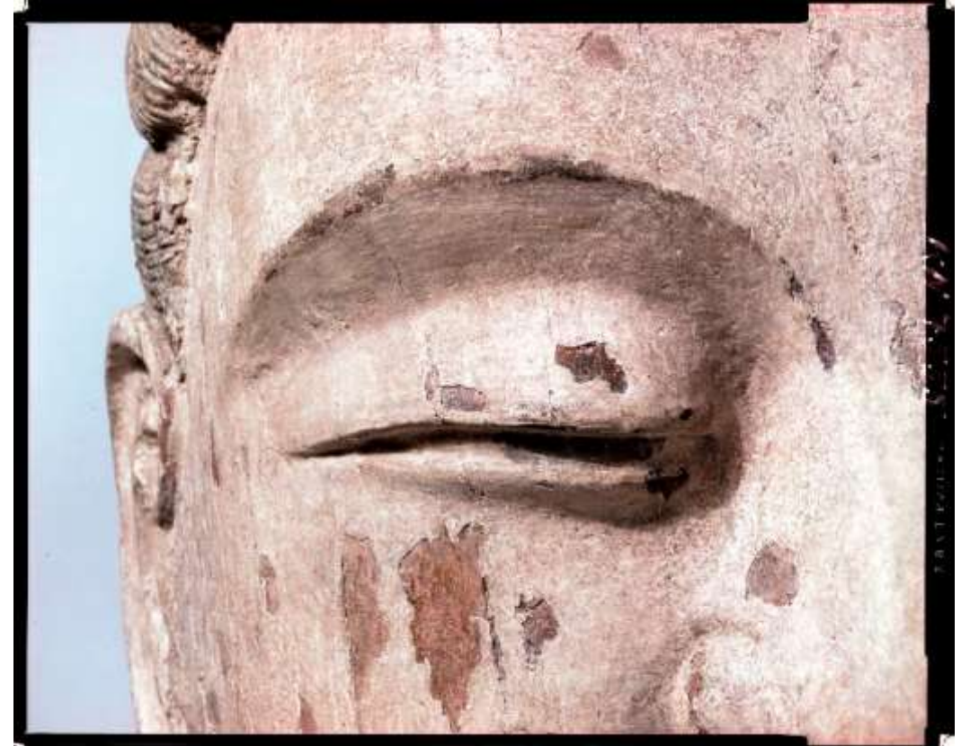
Bodhisattva head (before/after restoration), 17th century, Musée royal de Mariemont (Morlanwelz-Mariemont)