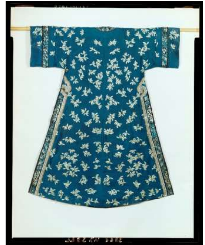
Dress in silk mesh with embroidered butterflies, late 19 th century, A&H Museum (Brussels)