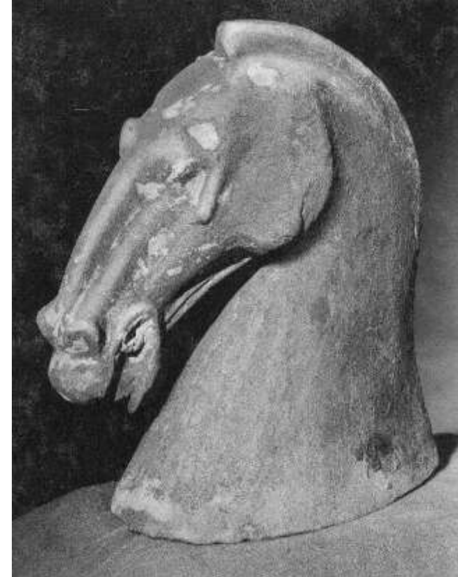
Chariot with ox , -199 (BCE) – 300, A&H Museum (Brussels) & Horse head, -206 (BCE) – 220, Musée royal de Mariemont