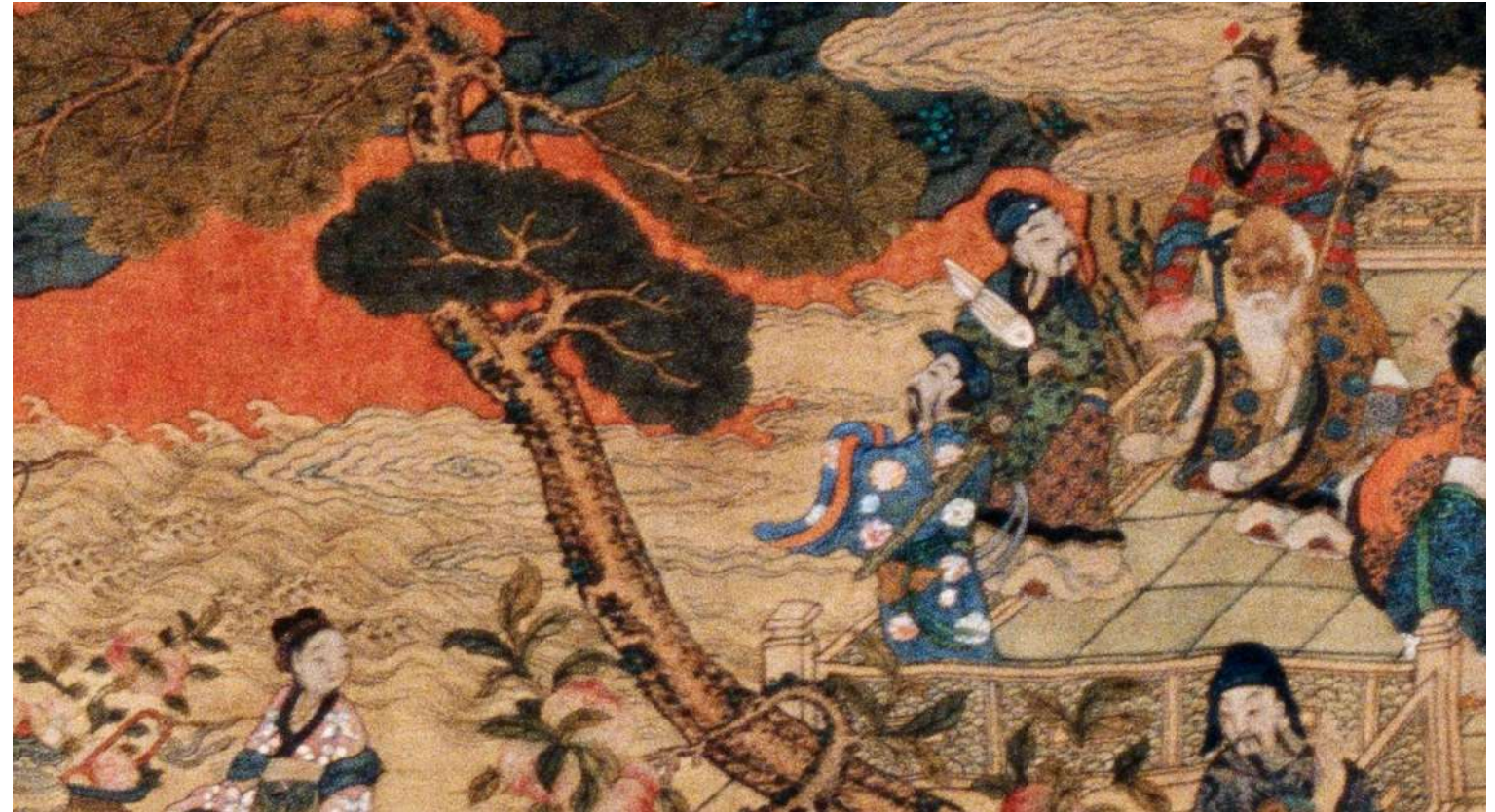
Legend of the magic peach, 18 th century, MAS (Antwerp)