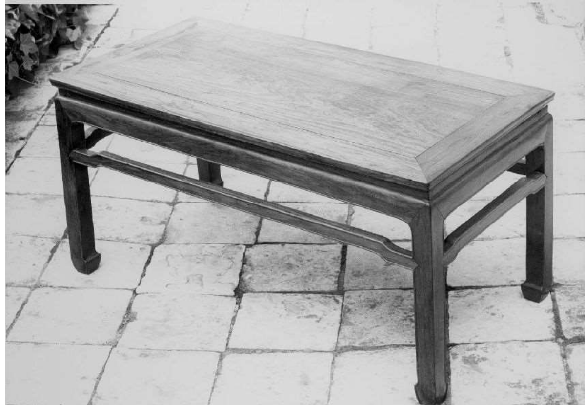
Small cupboard, 17th-18 th century, Bijlokemuseum/STAM (Ghent) & Tea table, 15th-17th century, Design Museum (Ghent) [CC BY-SA KIK-IRPA, Brussels, M205128 &