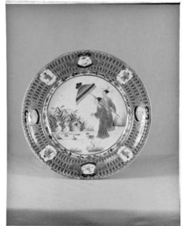
Decorative plates from collections in Antwerp, Saint-Gilles (Brussels) and Ghent, 18th century [CC BY-SA KIK-IRPA, Brussels, M106275 - X141922 - M115358]