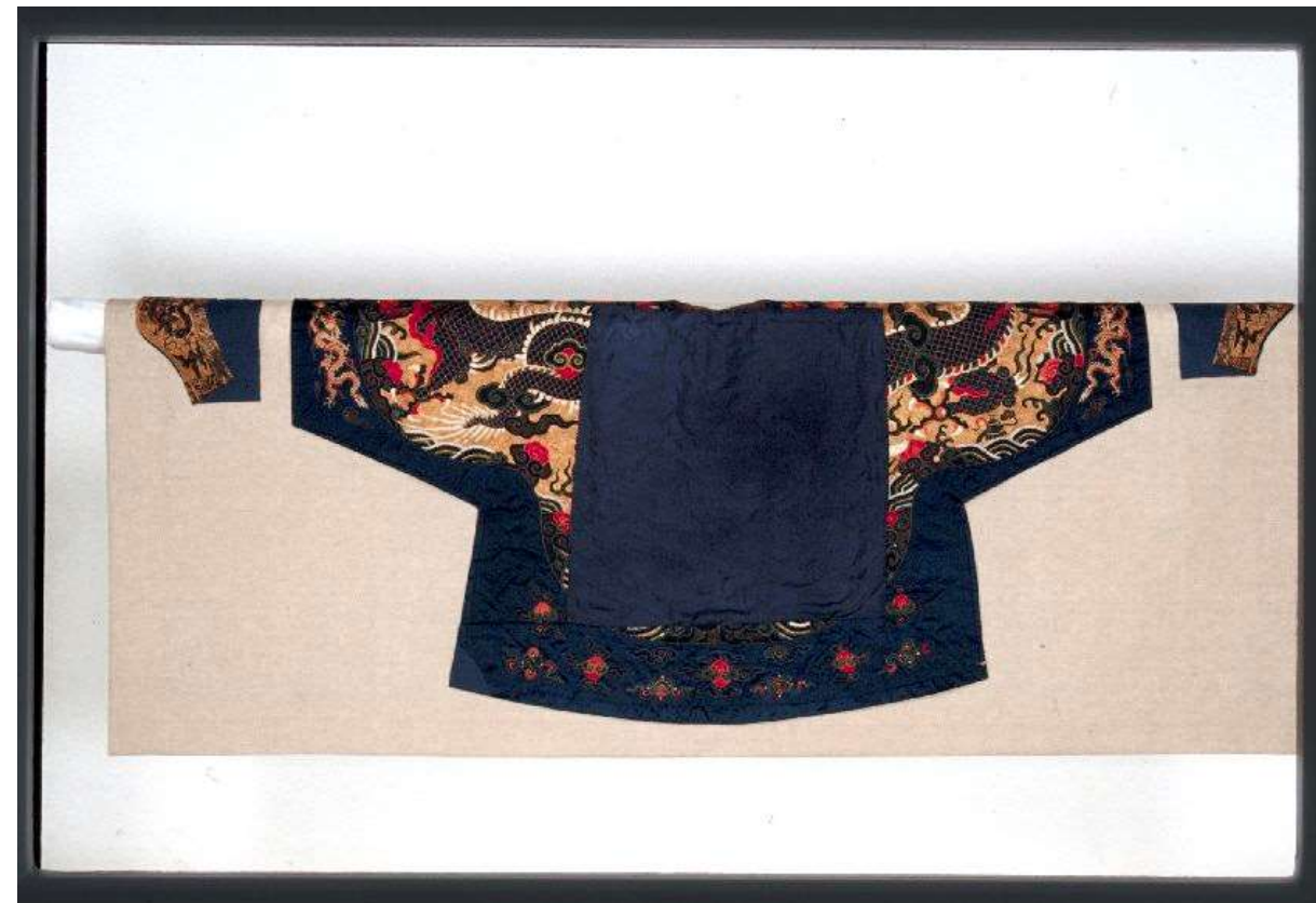
Traditional costume, ca 1740, A&H Museum (Brussels)