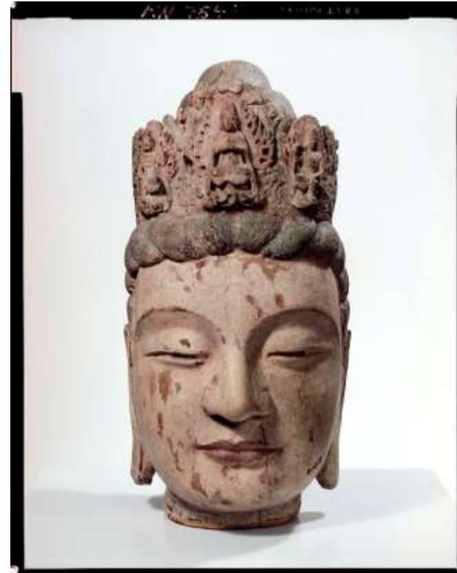
Bodhisattva head (before/after restoration), 17th century, Musée royal de Mariemont (Morlanwelz-Mariemont)