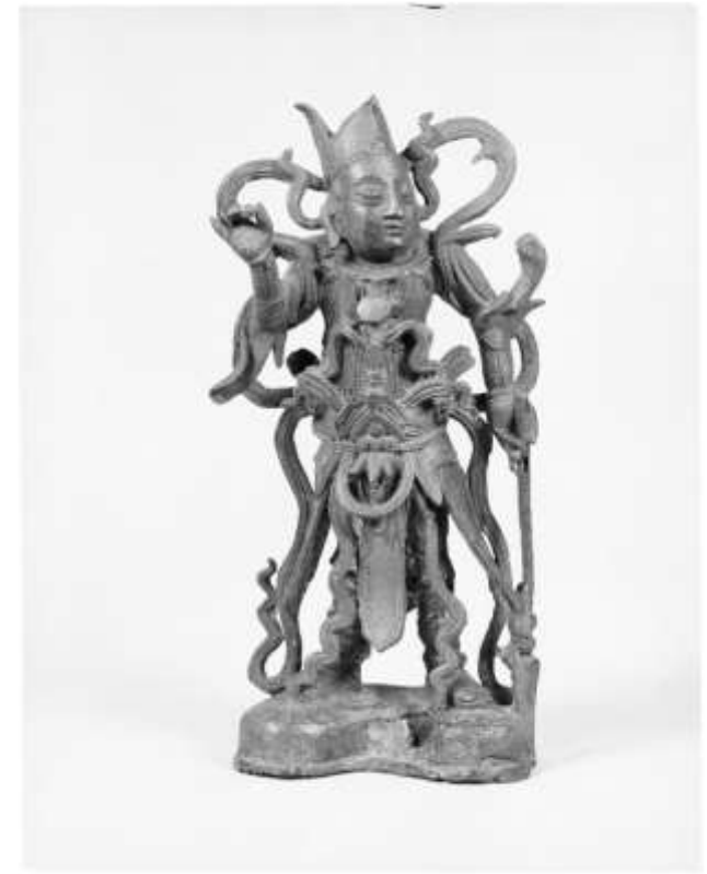
Bouddha head, 7 th -9 th c. – Bouddha sitting, 18 th c. – God of War, 18 th c. (Bijlokemuseum/STAM, Ghent)