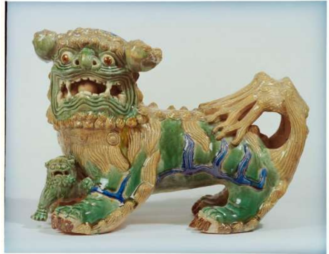
2 Fô lions, 19 th century, Museum voor Oudheidkunde en Sierkunst en Schone Kunsten (Kortrijk) [CC BY-SA KIK-IRPA, Brussels, KM011221 & KM011220]