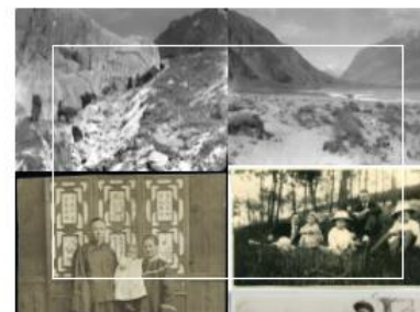
780 Scenes and people from China [vol 2] ITEMS Curated by Sofie Taes