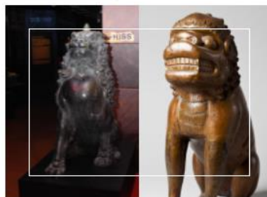
206 Chinese artefacts [vol 1] ITEMS Curated by Sofie Taes