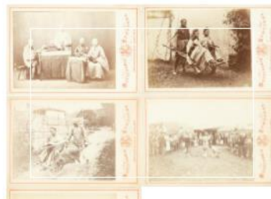
87 China-souvenirs from Fotografija Ermolina ITEMS Curated by Sofie Taes