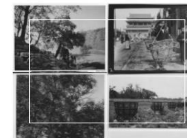
220 Osvald Sirén's evocative China-impressions ITEMS Curated by Sofie Taes