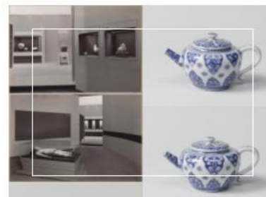
68 Chinese artefacts [vol 2] ITEMS Curated by Sofie Taes