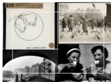
707 Scenes and people from China ITEMS Curated by Sofie Taes