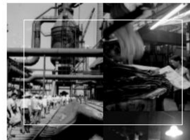
124 Wolfgang Schröter's expressive portraits ITEMS Curated by Sofie Taes