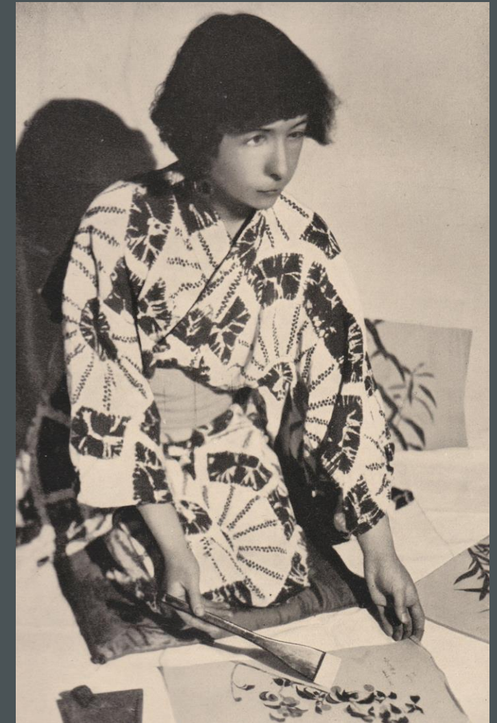
Alma Karlin (1889-1950)