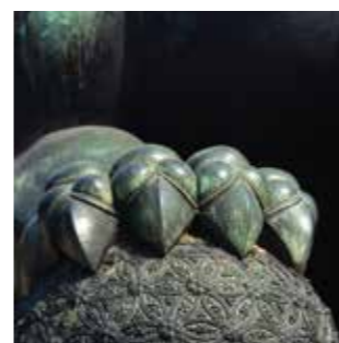
Detail of the lion sculpture at the gate to Tiananmen Square in Beijing, China, c. 1990