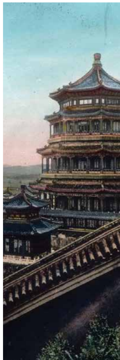
Trip to China, 1910

PAGODE's contribution to Europeana will explore representations of the mutual cultural and artistic influences between Europe and China.